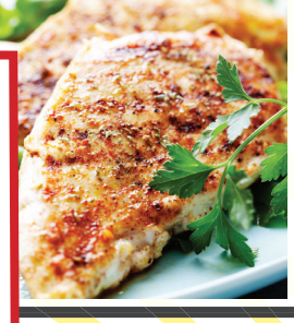
Boneless Skinless Chicken Breasts Southern Grown, Tray Packed