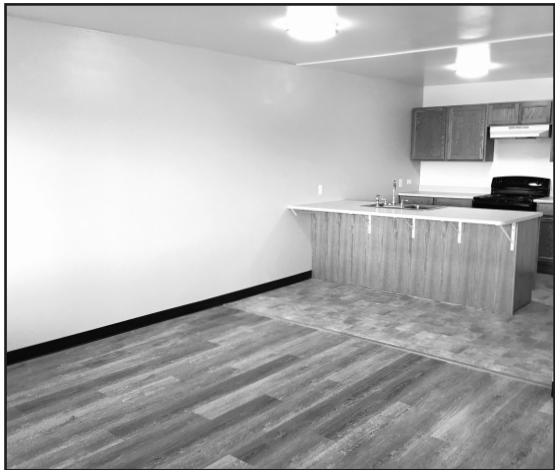
Kitchen & living area.