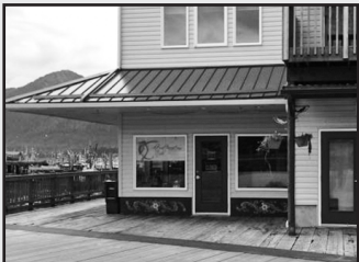
Commercial space that could be remodeled into residential. ..... New Lower Price! $275,000