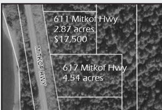
Two view lots south of town. Almost 7 1/2 acres! 611 - $17,500 • 617 - $20,000