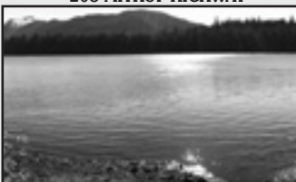
New to Market! Recently improved waterfront lot with pad along Wrangell Narrows. Almost a 1/4 of an acre with utilities. Located adjacent to the bike path and close to downtown Petersburg. .....$289,000