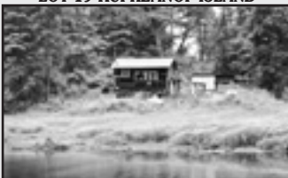
New to Market! Great starter cabin on a salmon stream at low tide. Wildlife and waterfowl are some of your neighbors. Clamming and crabbing just down the beach. .....$65,000