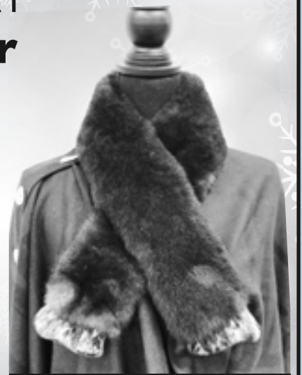
Sea Otter with seal tip Scarf by Will Ware over a Button Shawl by Native Northwest